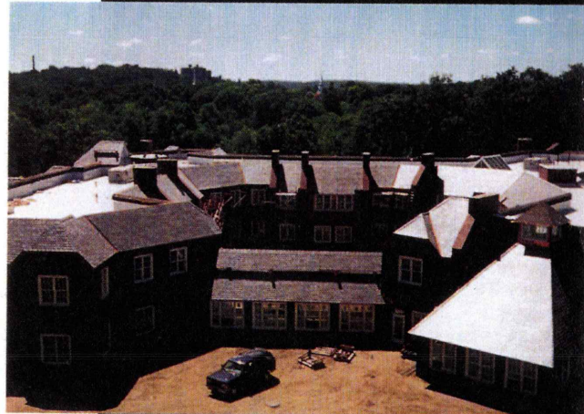
Slate & copper cornice work Carmel Terrace, Framingham, MA

An important footnote to the "weather challenged" oceanfront building: Associate Roofing is unique in that the full crew is on hand all year. Some roofing companies make hay in the summer and disappear all winter. Associate's crew is around in hurricane and blizzard weather when you and your roof need them most.