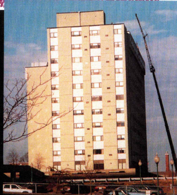
Fully adhered E.P.D.M. by Versico (27,500 sq.ft) Melville Towers, New Bedford, MA