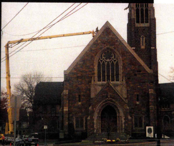
Clay tile repair Bethany Church, Quincy, MA