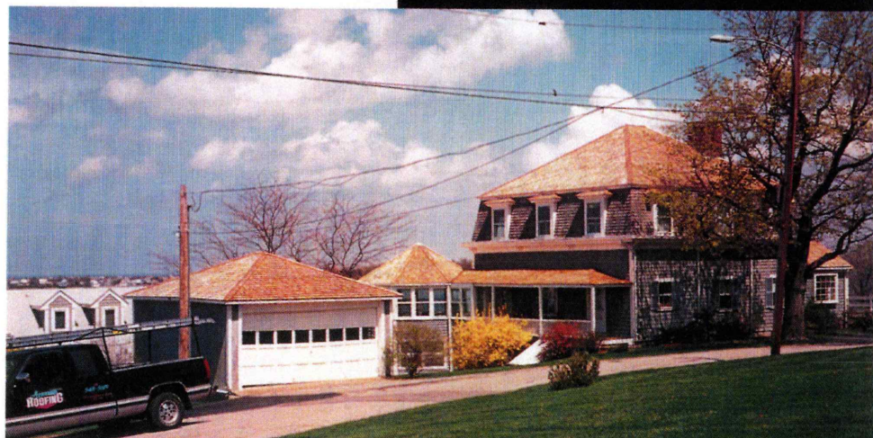
Red cedar re-roof Hingham, MA