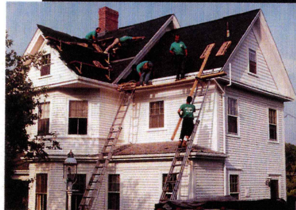
GAF fiberglass shingles Plymouth, MA